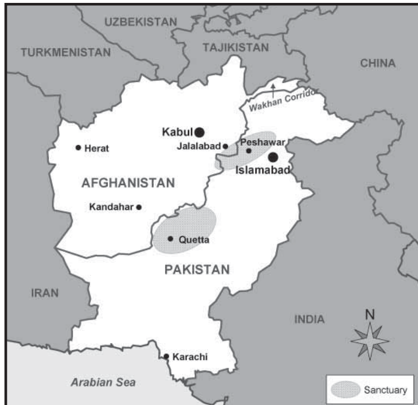
MAP 3. SANCTUARIES ON THE AFGHANISTAN / PAKISTAN BORDER.

By this time Moscow developed greater interest in their southern neighbor. It helped that Afghanistan was the path south and west, the route toward both the oil rich Middle East and the long-coveted warm water port on the Indian Ocean. Also, the geopolitical situation invited action. The United States, the Soviet Union's great power rival, had just concluded its costly war in Vietnam. American presidents Richard Nixon, Gerald Ford, and Jimmy Carter had for the better part of the decade pursued the conciliatory policy of détente toward the USSR. Recent Soviet actions elsewhere in the developing world, for example Angola, had been met with indifference by the free world. And in 1979, the Iranian revolution and hostage crisis consumed much of America's attention. With Afghanistan in chaos, the time for Soviet intervention was at hand.