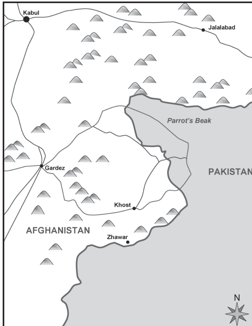
MAP 4. PARROT'S BEAK REGION ON AFGHANISTAN / PAKISTAN BORDER.

guerillas. Tactics included carpet bombing of agricultural regions and wholesale destruction of villages. The Soviets have created a 30-mile deep no-man's-land on the border with Pakistan. This has led to widespread food shortages and destroyed the guerillas' infrastructure in many regions. Soviet commando operations and air strikes against guerrilla caravans bringing in CIA-provided military supplies have forced