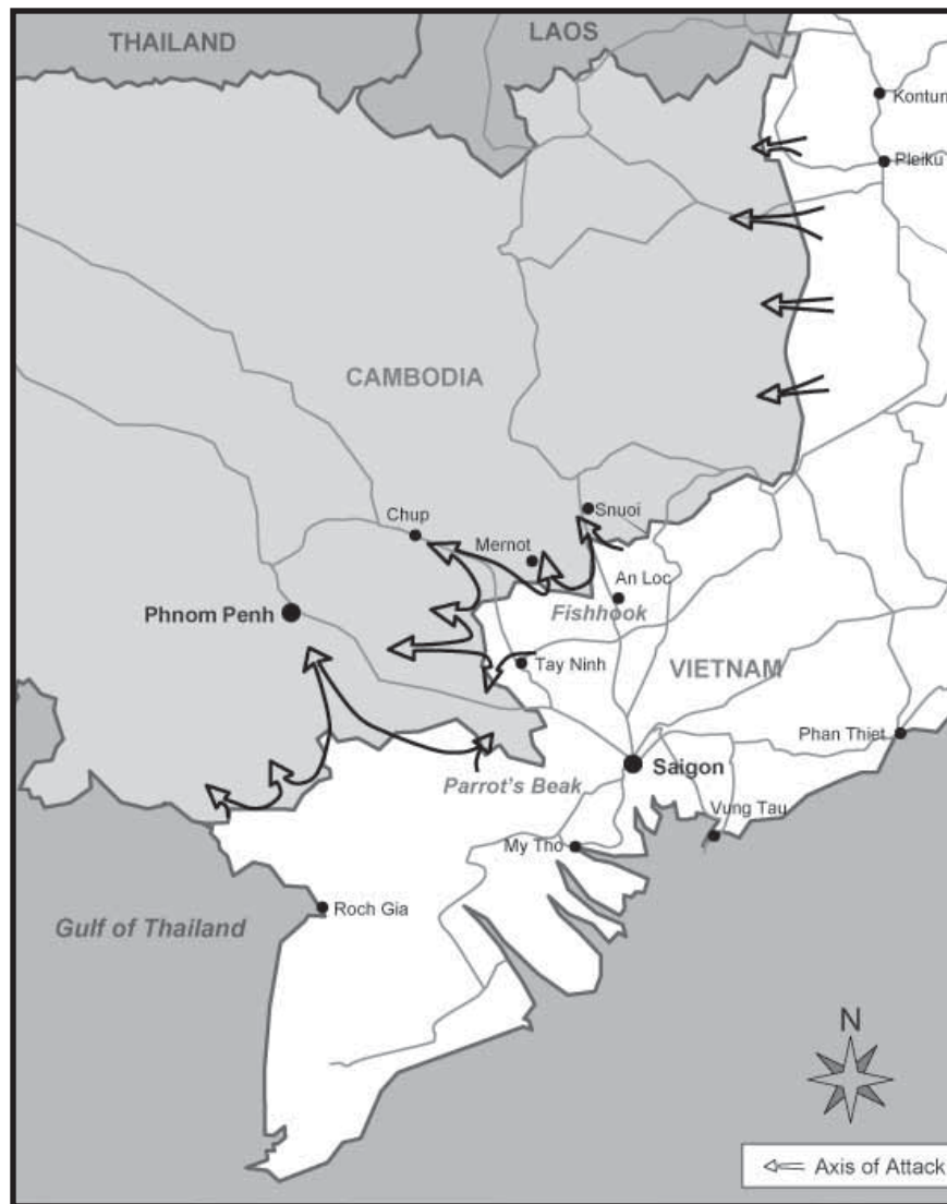
Map 2. The 1970 Cambodia Incursions.

compound, and a training area. There was even a sunken clay swimming pool surrounded by bamboo lounge chairs. Awed by the complex's sheer size, troopers quickly dubbed it "The City." 71