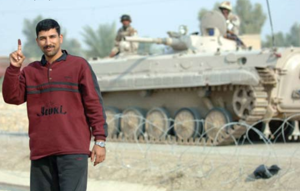
Man displays inked finger after voting in Iraq's first official democratic elections at polling site secured by Iraqi army, December 2005

combat experience in Iraq and Afghanistan is often cited to argue that the Army can easily step back into the conventional warfighting mode