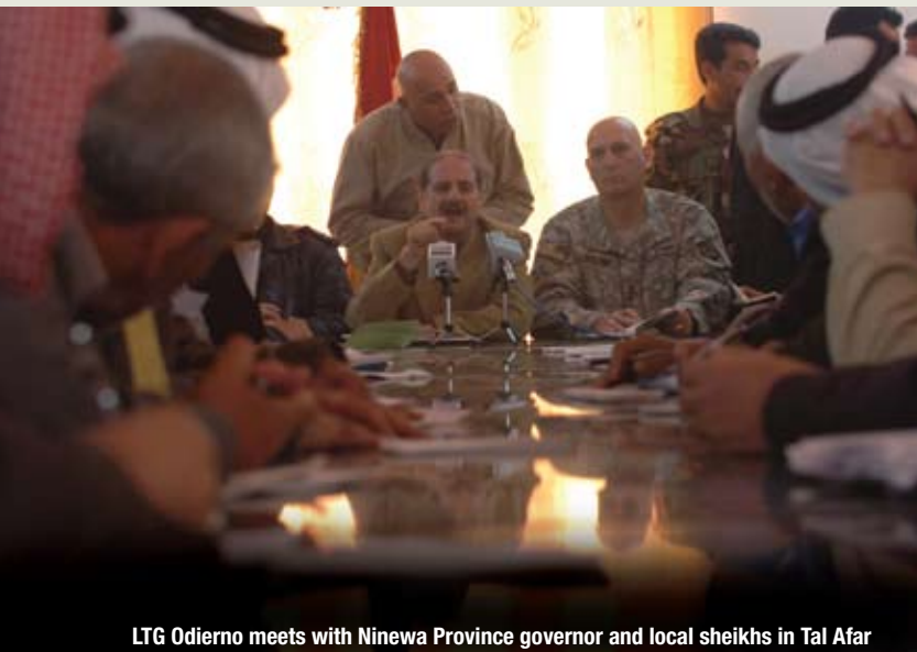
LTG Odierno meets with Ninewa Province governor and local sheikhs in Tal Afar

So our current counterinsurgency, operational, and stability doctrines have moved well beyond simple Army doctrine and become the organizing principle for the Army and, more subtly, the shaper of an American foreign policy premised on intervention into unstable areas