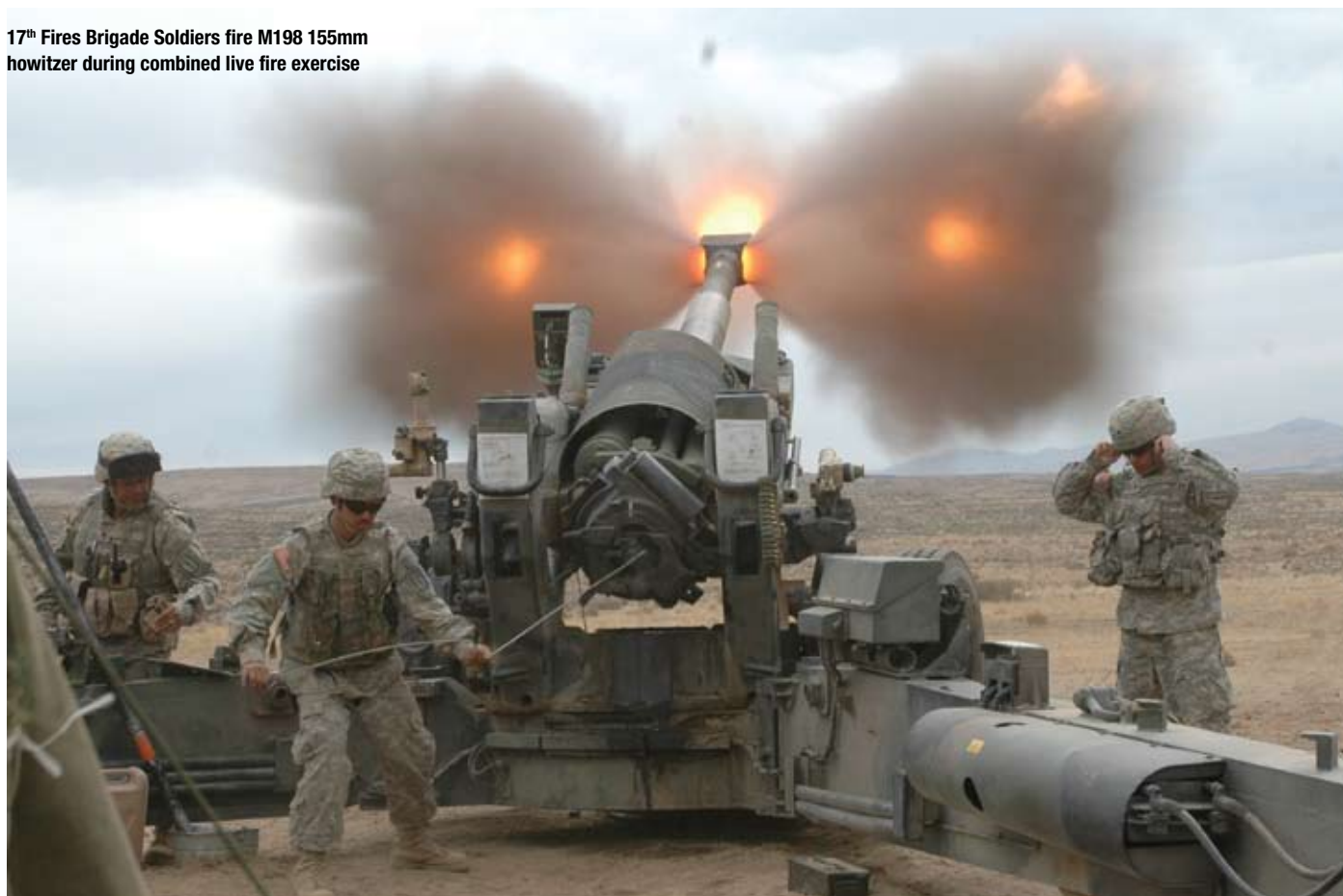
17 th Fires Brigade Soldiers fire M198 155mm howitzer during combined live fire exercise

aside from a handful of critical articles by firebrand writers, not much has been written that fundamentally questions current Army doctrine and where it is going