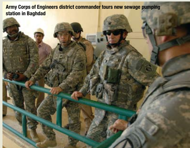
Army Corps of Engineers district commander tours new sewage pumping station in Baghdad