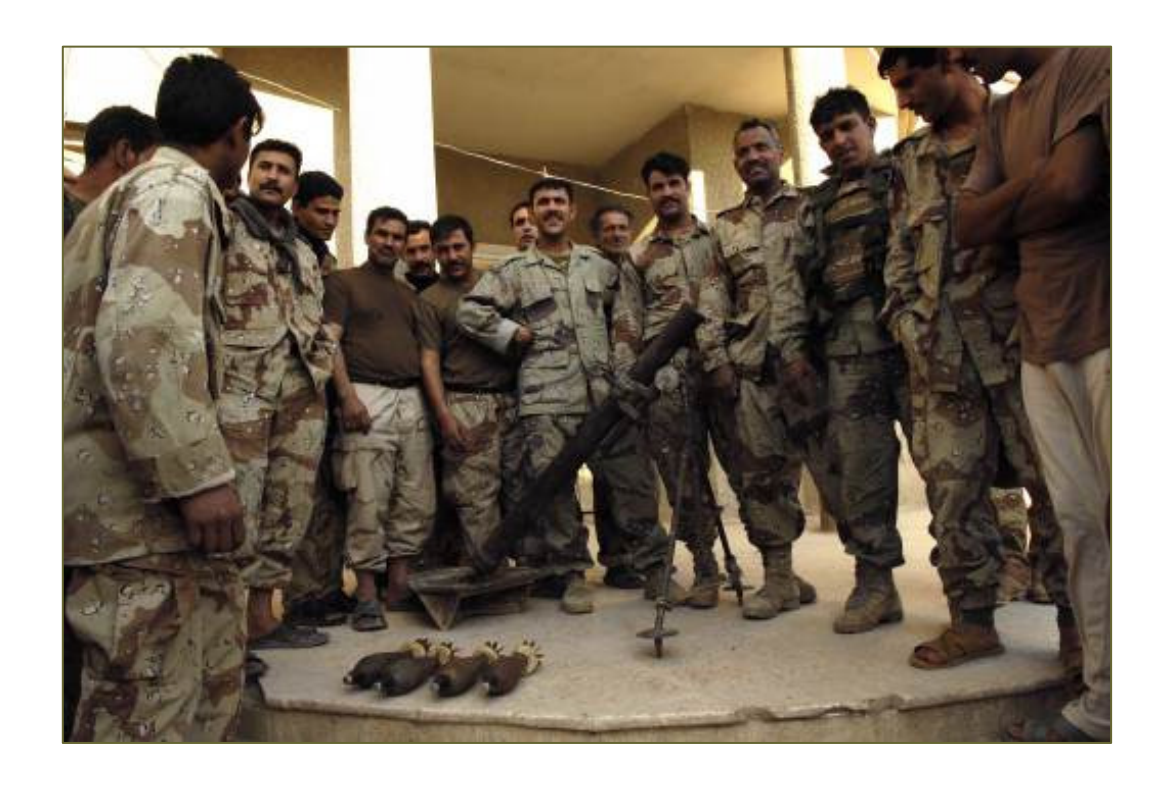
03/29/07 - Iraqi army soldiers with 2nd Battalion, 2nd Brigade, 5th Iraqi Army Division stand next to the mortar tube and rounds at Combat Outpost X-Ray, Iraq, March 29, 2007, after finding a destroying a four-man-insurgent mortar team. (Released)