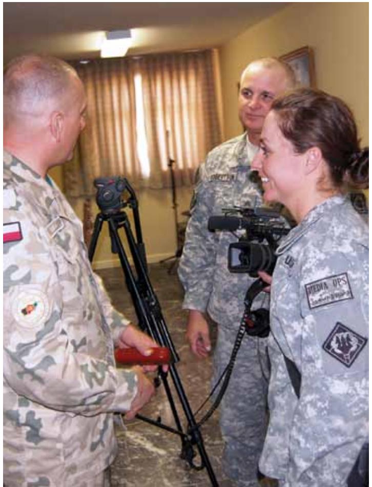
NEWSMAKERS MISO (left) and PA Soldiers have similar skills and resources needed to capture, develop, produce and disseminate multimedia products that can be used to inform and influence audiences. U.S. Army photos.

From surrender appeals to weapons buy-back to national-pride programs to publicizing federal and local elections, PSYOP has delivered convincingly credible and truthful information for effect.