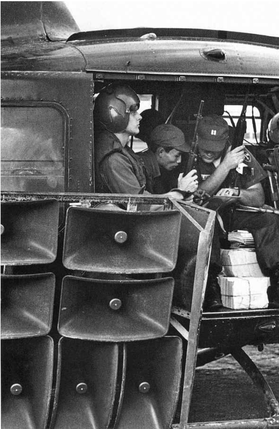
HISTORICAL PERSPECTIVE In Vietnam the traditional concept [of PSYWAR] was broadened: Americans wielded a double-edged psychological sword of the “dual war.”

At the time, the prevailing opinion was that PSYWAR's ability to influence foreign audiences exceeded the boundaries of combat and the tactical battlefield, and that a more expansive definition and operational construct were needed. Understanding the limitations of PSYWAR and the need to communicate U.S. goals and objectives to foreign audiences,