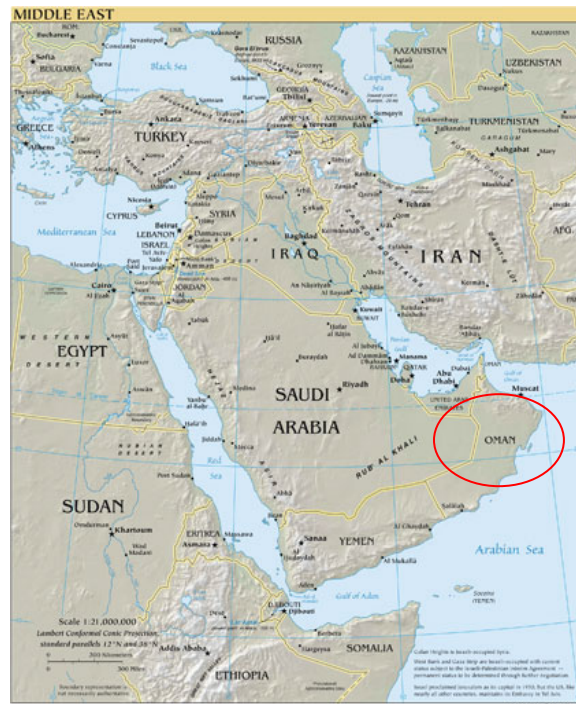
The Middle East

An often-overlooked counterinsurgency campaign of the mid-20 th century was the one that raged from 1965-1976 in the Sultanate of Oman. Overshadowed by the larger conflicts that engulfed Southeast Asia, by 1970 a communist-led insurgency in the Southern Omani province of Dhofar (Dhofar) came very close to achieving victory over the British-backed government of the Sultan. However, in a remarkable turnabout grounded in time-tested counterinsurgency ‘best practices,’ by 1976 the communist insurgency had been defeated and government control restored to this strategically located nation. This paper will describe the causes of the insurgency, the actions of the insurgents and counterinsurgents, and finally, the factors that led to the success of the government and the defeat of the insurgency.