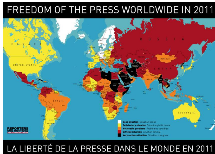
Figure One: Press Freedom Nations at Risk, 2011

Attacks against journalists in Mexico have been rising throughout the drug war and the consensus in the media and among journalists is that it has reached a critical mass. As a result Reporters Sans Frontières characterizes press freedom in Mexico as being in a “difficult situation” (see Figure One) for 2011.